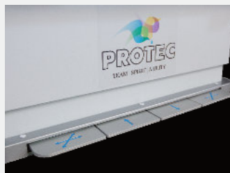
height adjustment table