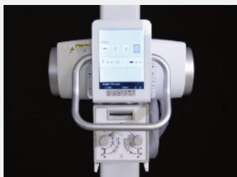
central control unit