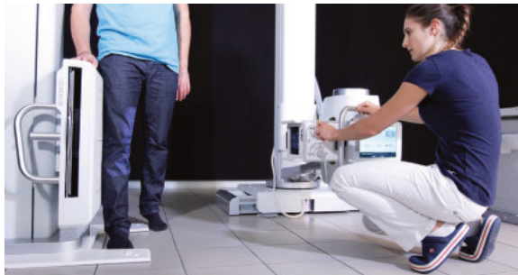
Exposure knee standing under stress