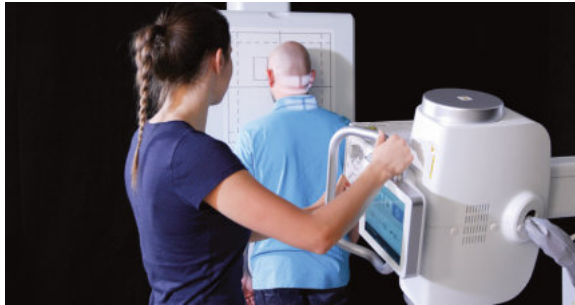
Exposure lower jaw 15° standing