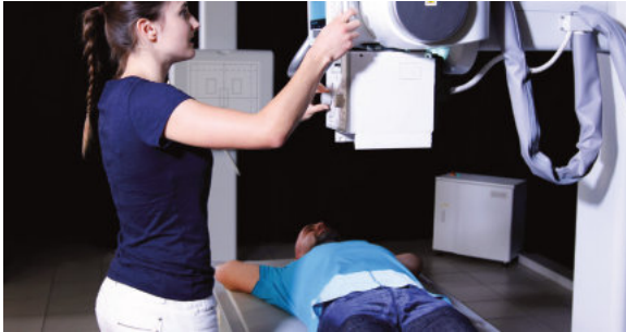
Exposure pelvis ap lying