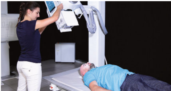
Exposure head 30° lying