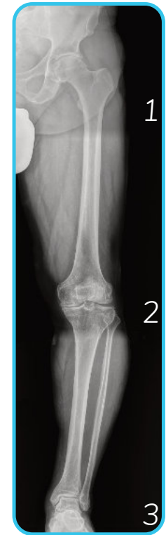
automatic stitched exposure