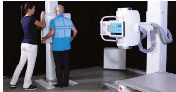
Exposure thorax pa standing