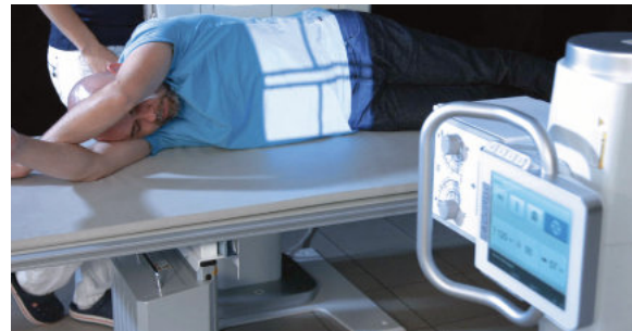
Exposure abdomen lateral on mobile table in front of wall stand