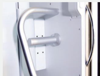
wall stand backside