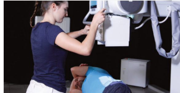
Exposure lumbar spine lateral lying