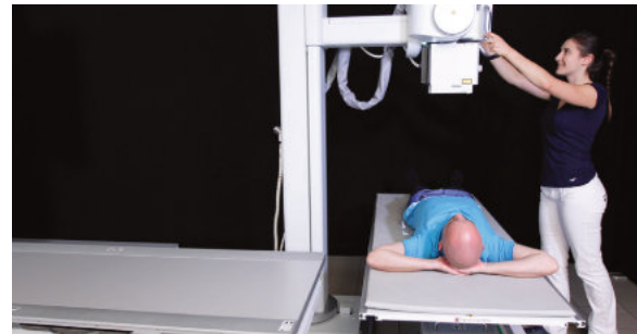
Exposure pelvis ap lying on mobile table, tube column 90° rotated