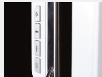
wall stand control